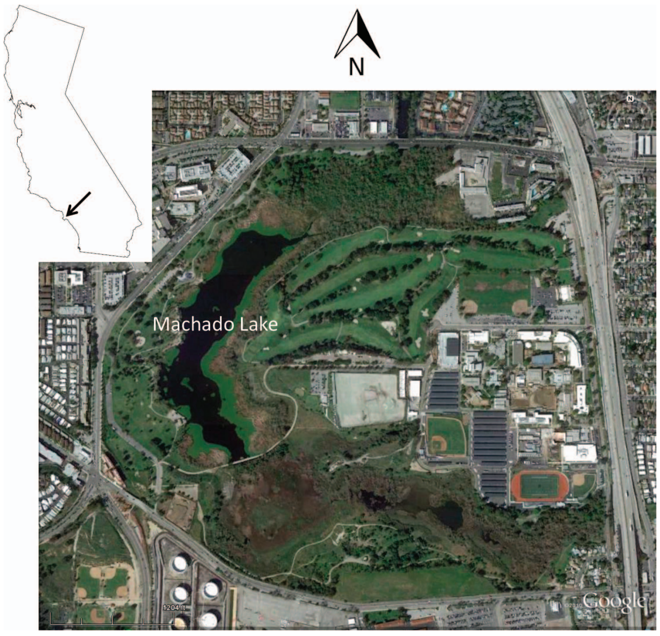
Fig. 1.—Aerial photo of Machado Lake and surrounding areas, Harbor City, California, USA (inset). Ephemeral wetlands mentioned in text are located south and southwest of the baseball diamond visible in the photo area. A color version of this figure is available online.

including the lake; Fig. 1). The lake receives runoff and stormwater from a 6300-ha urban drainage via the channelized Wilmington Drain (formerly the Bixby Slough), as well as from several stormwater drains. As a result, the lake is considered impaired by bacteria, ammonia, copper, and lead (City of Los Angeles 2014). Depending on the season and intensity of recent vegetation-control efforts, as much as a third of the lake can be densely covered in exotic Water Primrose ( Ludwigia sp.). Native Tule Bulrush ( Scirpus spp.) and exotic Cattail ( Typha spp.) are also common along the margins of the lake. Although heavily polluted, the park harbors remnants of native riparian forest and freshwater marsh that have largely been eliminated from the rest of Los Angeles County. As a recipient of urban runoff and lacking any surface flow outlet to the nearby Port of Los Angeles,